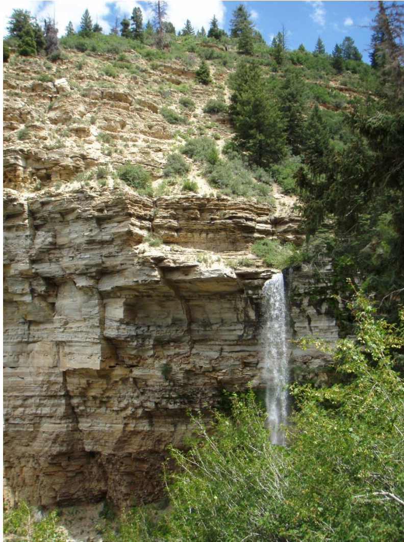
East Fork Falls